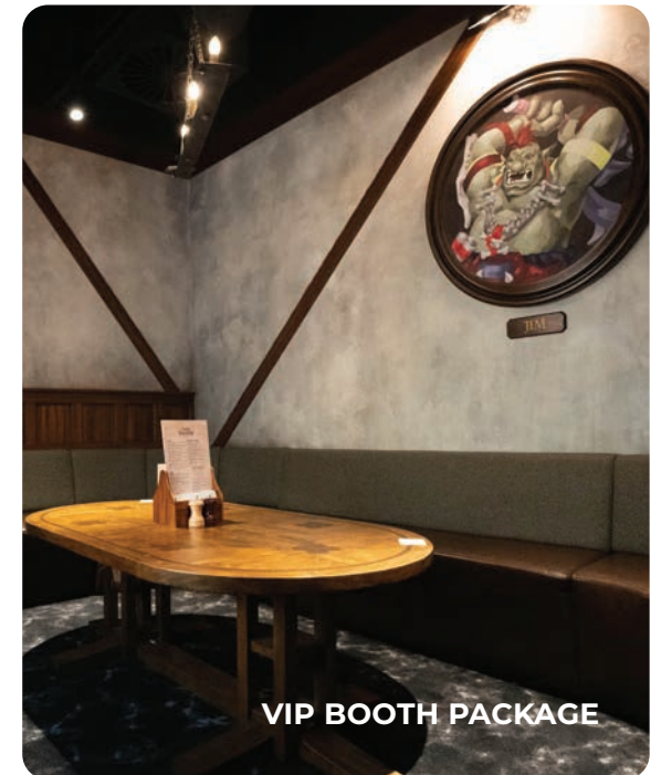
VIP BOOTH PACKAGE

*Extra package hours available to purchase upon request.